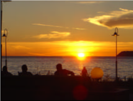
The reward at the end of the day was the view from our meeting room!

The business agenda included completing the trustee assignments to TACTC's committees. A copy of TACTC committees is included as an insert in this mailing. Special thanks to each person serving on a committee this year for making TACTC a better organization. The TACTC officers set the dates for the next Board of Directors' meeting (mark your calendar for Friday, November 5 ), and they started the process of formalizing the way the $3,100 for scholarships will be distributed to students. The money was raised at the May Convention during the dinner auction.